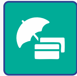
Liability & Credit Insurance