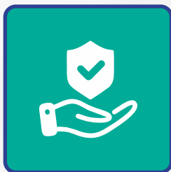
All Risk Insurance